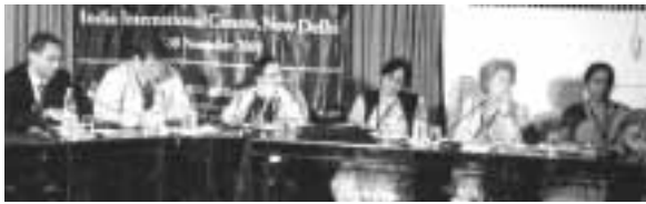
INTERNATIONAL ROUNDTABLE ON EDUCATIONAL BROADCASTING IN THE COMMONWEALTH, NEW DELHI, NOVEMBER 2001

Several events took place in conjunction with the meeting of COL's Board of Governors in November 2001 in New Delhi, which involved COL staff and Board members who were present. These included a colloquium on emerging scenarios in distance education, a roundtable for international educational broadcasters active in educational television and a workshop on the dissemination of materials developed for the empowering of rural women, the latter in collaboration with IGNOU's School of Continuing Education. COL also supported and made presentations at an international conference on volunteerism, NGOs and open schooling organised by India's National Open School.