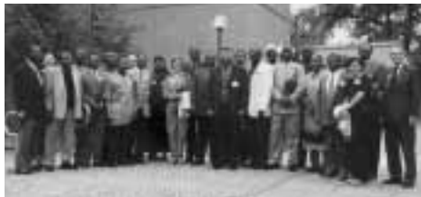
MANAGING CHANGE LEADERSHIP CONFERENCE, AUGUST 2001

COL and its partners organised and delivered three management institutes in 2001: