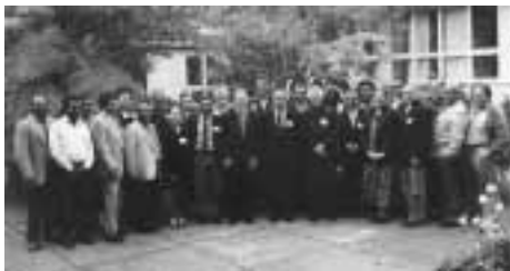
PARTICIPANTS AT THE SOUTH PACIFIC TVET MANAGEMENT INSTITUTE IN WELLINGTON

THE FIRST of a series of annual Management Development Workshops for Teacher Education Administrators from Sub-Saharan Africa, co-sponsored by COL and the Ministry of Foreign Affairs, Singapore, was held in Singapore in November 2001. The 16 participants represented 10 countries — Botswana, Lesotho, Malawi, Mozambique, Namibia, Nigeria, Seychelles, Sierra Leone, Zambia and Zimbabwe. Workshops covered four themes — distance education and teacher education, leadership and management, case studies on the operations of Nigeria's National Teachers' Institute and an orientation on Singapore's education system. The workshop series seeks to strengthen the capacities of Africa's teacher education systems, especially in the use of distance education. Local facilities are provided by the National Institute of Education, Nanyang Technological University,