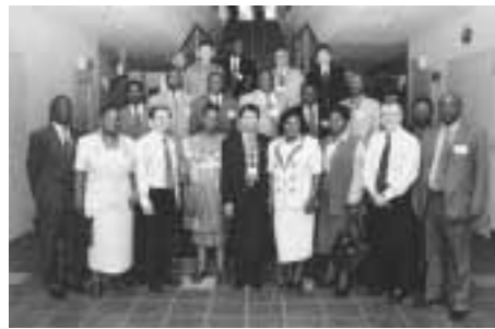
SUB-SAHARAN TEACHER EDUCATION MANAGEMENT DEVELOPMENT WORKSHOP, SINGAPORE