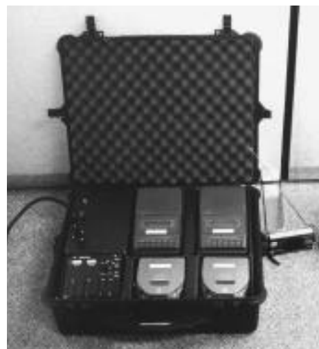
FM broadcast station in a briefcase

The low-power transmitter itself is manufactured by Total Point Inc., of Yukon, Canada: http://www.totalnorth.ca