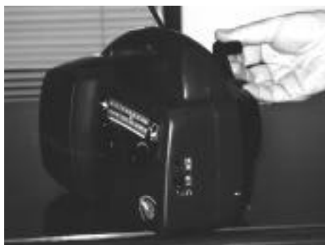
BayGen's "Freeplay" wind-up radio receives AM and FM. Another BayGen model also receives shortwave broadcast signals.

With approximately 60 turns of the crank (20 seconds of winding), a generator supplies electricity to the radio and amplifier for