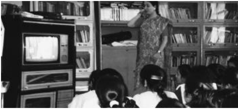
Instruction for hearing-impaired students at the National Open School's Delhi Learning Centre