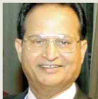
HONORARY FELLOWS OF COL (2008)