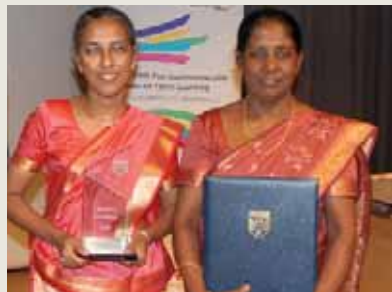
AWARD OF EXCELLENCE FOR DISTANCE EDUCATION MATERIALS (2008)