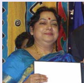
AWARD OF EXCELLENCE FOR INSTITUTIONAL ACHIEVEMENT (2006)