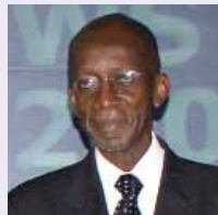
HONORARY FELLOWS OF COL (2006)