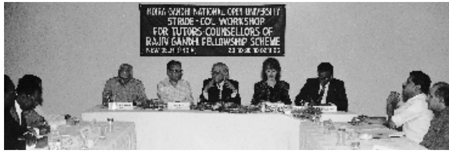
Orientation workshop for tutors assisting with the second year of the Rajiv Gandhi Fellowship Scheme, conducted by the Staff Training and Research Institute of Distance Education at IGNOU in New Delhi.